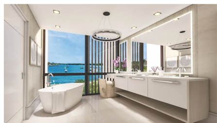
By ML staff. Images courtesy of Forté Luxe