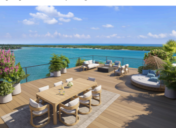
Rendering by wearevisuals.

The interiors boast engineered hardwood or large-format porcelain flooring alongside designer kitchens with sleek European-inspired cabinetry, Quartz countertops with a waterfall island, and top-of-the-line appliances and plumbing fixtures. Additional features include a separate laundry room with a full-size washer and dryer on the same level as the Owner's Suite, expansive walk-in closets, and luxurious spa-like bath retreats. Designer-appointed bathrooms feature European cabinetry, premium Quartz countertops, soaking tubs, designer fixtures, and glass-enclosed walk-in showers, complemented by exquisitely appointed interiors with a premium lighting package, including recessed lighting and signature fixtures at the entry and dining room.