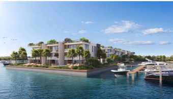
Rendering by wearevisuals.

Boasting modern architecture, the pet-friendly community will offer 13 private boat slips for up to 60-foot vessels (residents can purchase dockage), and a private resort-style swimming pool and sun deck with entertainment areas.