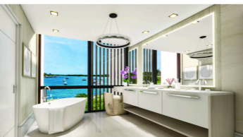
Rendering courtesy of Forté Luxe.

Residences at the development will offer expansive living areas ranging from 3,550 to over 5,000 square feet. Each home features expansive great room interiors with captivating views through full-height glass doors and windows, alongside a private garage with a grand entry that offers unrestricted views of the beach line and water. Private interior elevators, voluminous ceilings, and full-height sliding glass windows and doors further enhance homes. For outdoor enjoyment, there's a waterfront-covered terrace with built-in outdoor gas grills perfect for al fresco dining and spacious elevated balconies offering spectacular Intracoastal views.